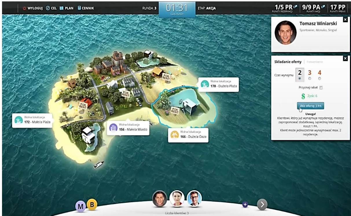
Picture 1. The sample screen of Archipelago Competence Game

Regarding the methodology, the computer game allows us to make accurate measurements of player's behavior along with his/her decision taking. In 'computer' reality, tested situational tasks are analyzed in details while in traditional form they often could be unnoticed. In Archipelago Competence Game all the decisions and behavior of the player are recorded, the program collects the data and information, asks the user questions to assess the understanding of the situation as well as others which are related to the strategic and objective purposes. The player receives feedback related to his strong points and suggested development direction. The Picture 1 shows the sample screen of the Archipelago Competence Game (Competence Game).