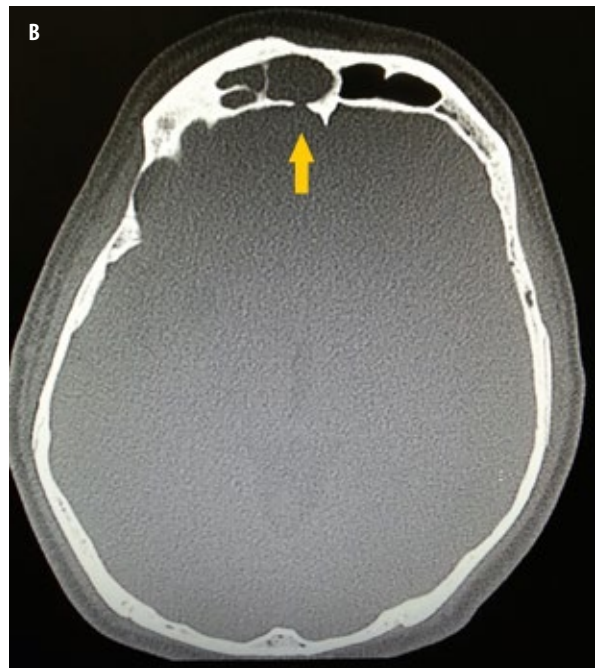
Fig. 2. A bony defect in the anterior and posterior wall of the right frontal sinus (arrow). There is also mild thickening with irregularity and enhancement at the adjacent right frontalis and orbicularis muscle (arrow)