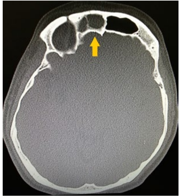
Fig. 1. Axial view of the CT scan showing sclerosis of the surrounding bony structures of the right frontal sinus with dense soft tissue located inside (arrow)

On examination, the patient was alert and conscious. His vital signs were stable. There was a large doughy swelling measuring 3 × 3 cm over his right frontal region, which was tender on palpation. Nasendoscopic examination revealed inflamed, congested and oedematous right ostiomeatal complex with mucopus and a grade I polyp. Computed tomography (CT) of paranasal sinuses (PNS) showed sclerosis of the surrounding bony structures of the right frontal sinus with minimally enhancing soft tissue density occupying the right frontal sinus (Fig. 1), which