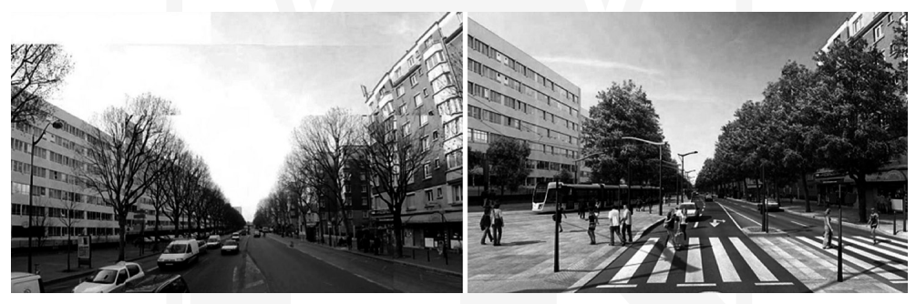
III. 5. Porte d'Aubervilliers in Paris, present state and the designed extension of T3 line.

In order to help realise the tasks resulting from effective legislation, a special tax system ( Versement transport ) was introduced to maintain and develop public transportation.