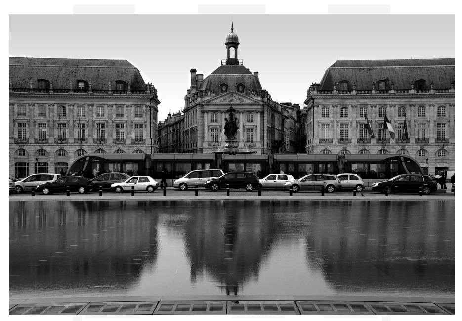
Ill. 9. Place de la Bourse, Bordeaux.

Thanks to modern technological solutions and comfortable tram-cars, it is possible to eliminate inconveniences traditionally associated with trams such as noise; vibrations; neglect; bothersome tracks. Today's tram-cars are environmentally friendly and move almost noiselessly through green areas. Overhead lines and posts do not degrade the valuable downtown areas.