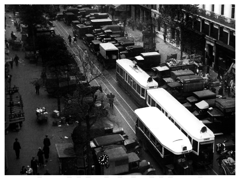
Ill. 2. Tram on busy streets of des Halles district in Paris, 1920. Source [21] Le tramway à Paris et en Il-de-France

of mobility. Old, deteriorated, slow and rusty trams on worn out tracks, often with bad route planning, lost their value in the eyes of society, while the new buses and trolleybuses appeared as the embodiment of progress. Urbanisation based on highways penetrating the cities, expressways, and traffic lanes stretching along river banks contributed to more extensive use of cars. Space for public transport, bicycles and pedestrian traffic was reduced as car traffic and the demand for parking space grew significantly [8, p. 79].