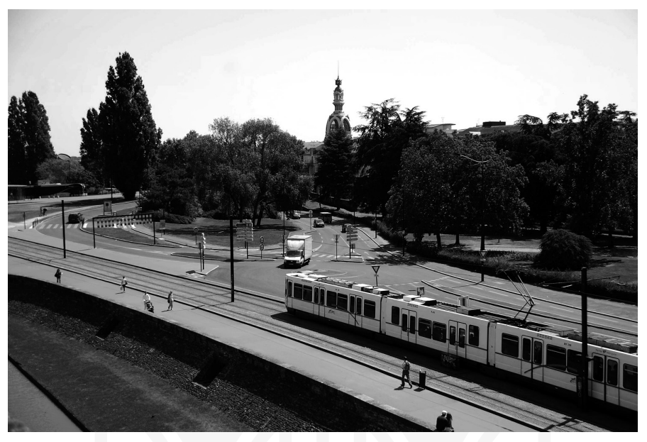
Ill. 3. In 1985, the first modern tram line was launched in Nantes.

cities, e.g. Rouen, Montpellier, Lyon. Some cities, like Bordeaux, abandoned plans for an underground system in favour of a tram network as a less expensive solution that was better adjusted to the city scale. In the Paris metropolitan area, the first tram line was launched in 1992, and in the city of Paris, in 2006.