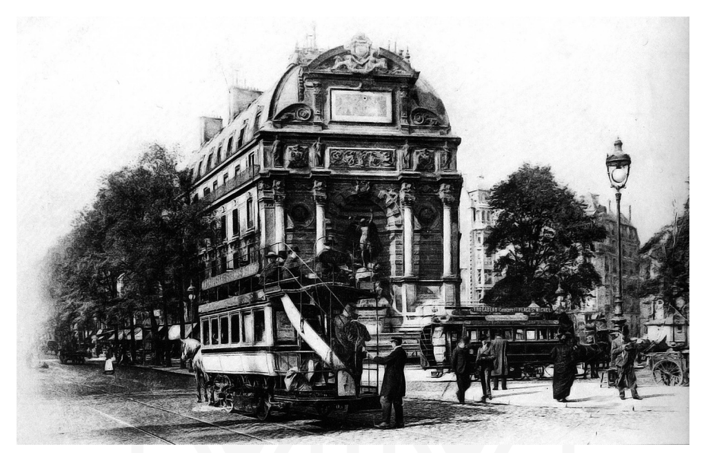
Ill. 1. Horsebus on Place Saint-Michel in Paris, early 20<sup>th</sup> century.

In the early 20<sup>th</sup> century, Nantes boasted a 39 km tram line transporting 11 million passengers per year [17, p. 101].