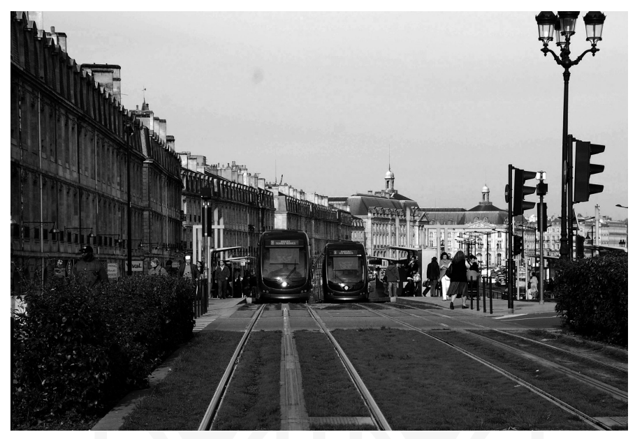
Ill. 4. Green track, and the 'third' power line, Quai Richelieu in Bordeaux.

connection between city areas, and, as one element of multi-modal systems, it fulfils the role of structuring urban space.