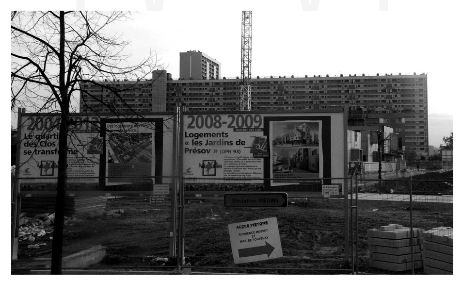
Ill. 6. Housing investments in the vicinity of T1 tram line, in Clos district, La Courneuve, Paris metropolitan area.

In the geographical respect, trams do not go beyond the central parts of metropolitan areas and their presence is not justified in low-density development. The radius