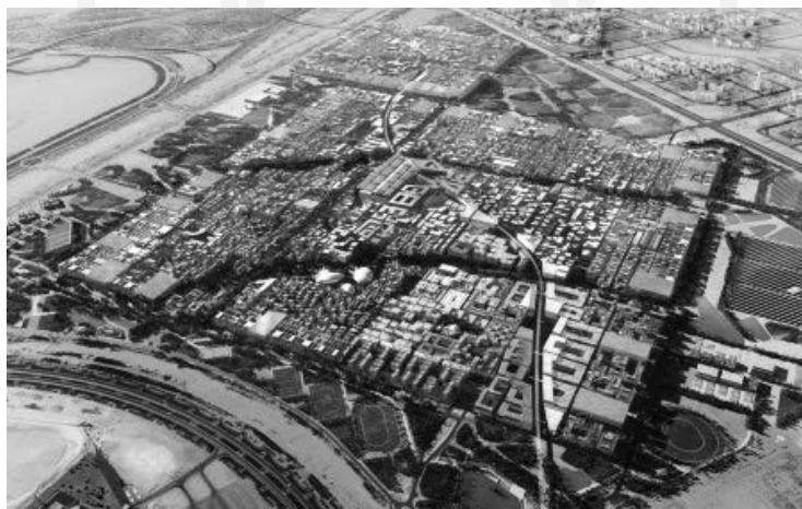
Fig. 6. Masdar – bird's-eye view (source: http://www.fosterandpartners.com )

The Clay Fields project showed exactly how important the education of users is. It is a passive social housing estate, the main objective of which is to assume a low cost of construction along with the use of biodegradable materials found in the vicinity of the construction site. This minimizes transport costs and also reduces the production of emissions. As for the residents, they were carefully instructed when to open the selected windows and in what order to minimize heat losses while ventilating. Indeed, the proper use has allowed reducing operating costs appreciably. And this is still merely a passive house.