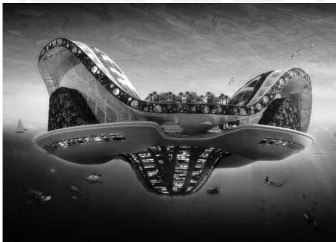
Fig. 3. A model of the Lily Pad floating complex

Thus, it became necessary to find a solution that would allow builders independence from soil. As it turns out, this was not that difficult. Based on the fundamental laws of physics, it was possible to create the first floating structures, which incidentally have also been established in Poland. Unfortunately, Polish construction law remains a problem because of the lack of foundations, which are an integral part of the design. Meanwhile, floating homes are already being created on a large scale in the Netherlands, where not only are they popular, but there are also areas in which no different type of buildings can be erected. This primarily involves all kinds of flood zones, located along the major rivers and lakes. In case of an emergency situation or a flood, the house just drifts in place, safely anchored to prevent it from floating away.