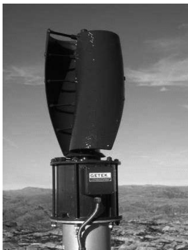
Fig. 1. An example of vertical turbine

until now (Fig. 1). The large tracts of flat industrial roofs, which generally are placed on open spaces, are particularly promising. Moreover, the weight of such turbines means they can also be mounted upon light structures, and the amount of electricity produced in this manner may be sufficient to power lighting. They are very efficient, use magnetic bearings and pose no threat to birds.