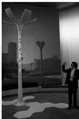
Fig. 2. Philips Blossom lamp

However, there are more possibilities. Philips has developed a design for Blossom smart solar lamps, also equipped with wind turbines (Fig. 2). This type of element can decide whether it is able to get more energy out of wind or the sun, and adjusts to the most efficient position. Moreover, the use of LED lamps led to a significant reduction in energy consumption at night, when they have the task of illuminating the streets. The special paving, which generates energy by pressure, is also noteworthy. Installing these panels around a bus or tram stop can produce sufficient electricity to light it through the night. Savings will be enormous, given the amount of such shelters exist in each major city.