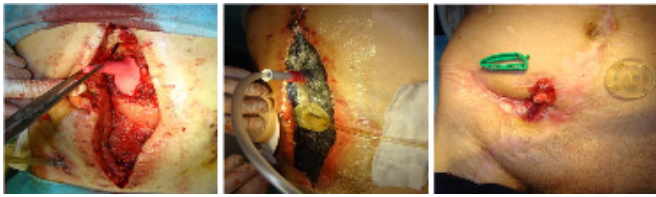
Figure 5. NPWT in cases of enteroatmospheric fistulas: left – placement of improvised obturator; middle – applying of NPWT; right – wound closure with functioning fistula.

We have experience of successful application of NPWT with bladder damage and thrombosis of the cavernous bodies of the penis (Fig. 6).