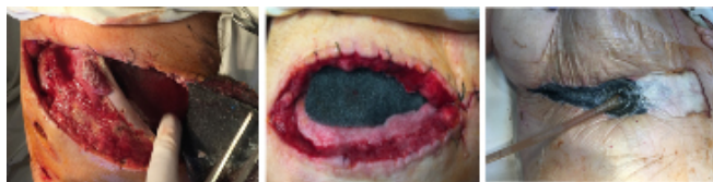
Figure 3. Treatment of pleural empyema after thorax combat injury: left – resection of the rib, thoracostomy; middle – closure of chest wall defect with a sponge; right – NPWT of the chest wall defect.

Indications for the use of NPWT in chest injuries ( n = 7 ) were infected wounds of the chest wall, defects of the chest wall with open pneumothorax, presence of a wound of the chest wall in combination with pleural empyema, temporary