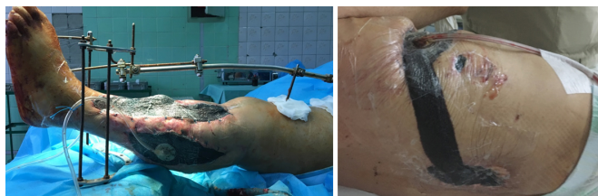
Figure 9. Blast injury with traumatic amputation of right lower limb at the level of the middle third of the shin: left – skin necrosis; middle – NPWT of right lower limb stump; right – closure of defect with tension system (TopClosure).

the split autodermotransplant in the complex relief of the wound surface, to accelerate its integration, and to prevent the traumatization of the graft.