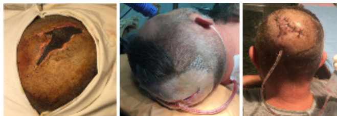
Figure 1. Shrapnel gunshot wound of the head. Surgical treatment of soft tissue defect.

Indications for the use of NPWT in cases with head injuries ( n = 6 ) were infected wounds, temporary closure of soft tissue defects. The purpose of NPWT was: cleansing infected wounds, reducing their size, stimulating granulation tissue and preparing for plastic closure (Fig. 1).