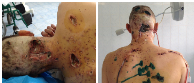
Figure 2. Multiple shrapnel wounds of the head, neck, thorax. NPWT of soft tissues of the neck.

NPWT of infected wounds in the neck ( n = 3 ) was used to temporarily close the wounds at the stage of preparation for their plastic closure (Fig. 2).