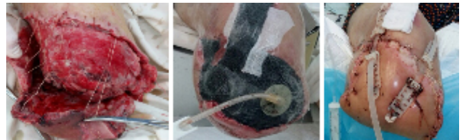
Figure 8. Blast injury with traumatic amputation of right lower limb at the level of the middle third of the shin: left – skin necrosis; middle – NPWT of right lower limb stump; right – closure of defect with tension system (TopClosure).

When combined wounds of various anatomical and functional sites were present, we used polyfocal NPWT using one or several vacuum devices. In this case, it became necessary to form external improvised or standard bridges for remote localization of injuries, as well as internal bridges, which densely contacted the main sponge with a number of wound defects located nearby. Internal bridges should not be in contact with vessels and nerves.