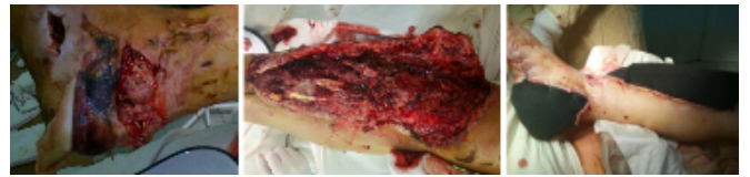
Figure 7. NPWT in treatment of injured lower limb: left - tissue defect in the foot area; middle - tissue defect in the shin area; right - forming closure.

In cases of combined wounds with various anatomical and functional sites polyfocal NPWT were used with one or several vacuum devices. In this case, it became necessary to form external improvised or standard bridges for remote localization of injuries, as well as internal bridges, which densely contacted the main sponge with wound defects located nearby. Internal bridges should not be in contact with vessels and nerves.(Fig. 9)