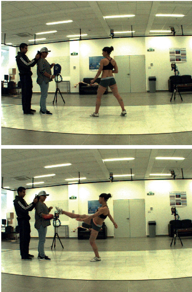
Figure 1. The sequence of the roundhouse kick

The test consisted of executing five repeated medium roundhouse kick with the left and right legs; a 30-second rest was given between each kick. After observing the visual stimulus getting on, the kick should be executed as quickly as possible, aiming to hit the palchagui and return to the starting position (Figure 1).