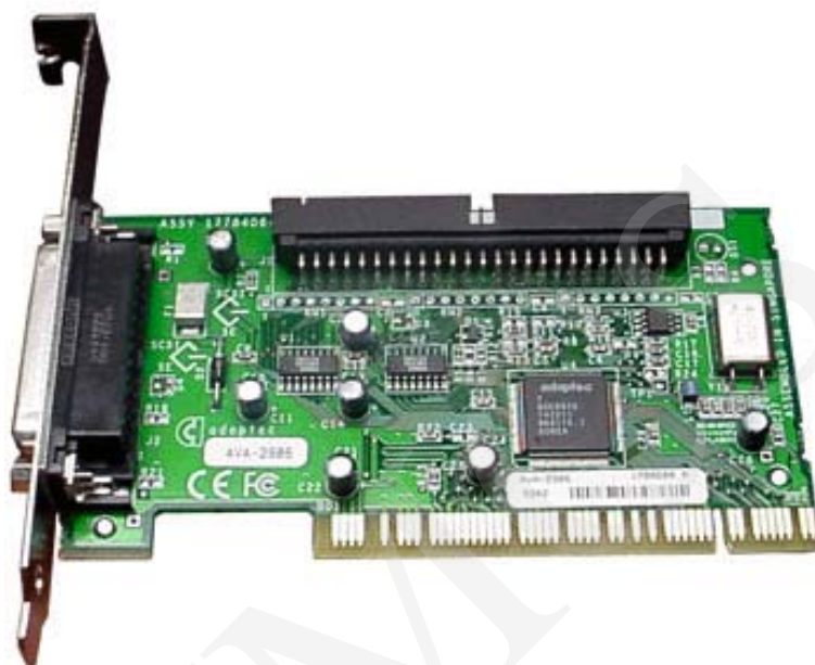
Fig. 2. Adaptec AVA 2906 controller.

For practical reasons (good quality development tools and documentation without restrictive license limits), our work is carried out in the GNU/Linux operation system environment with the application of a gcc compiler.