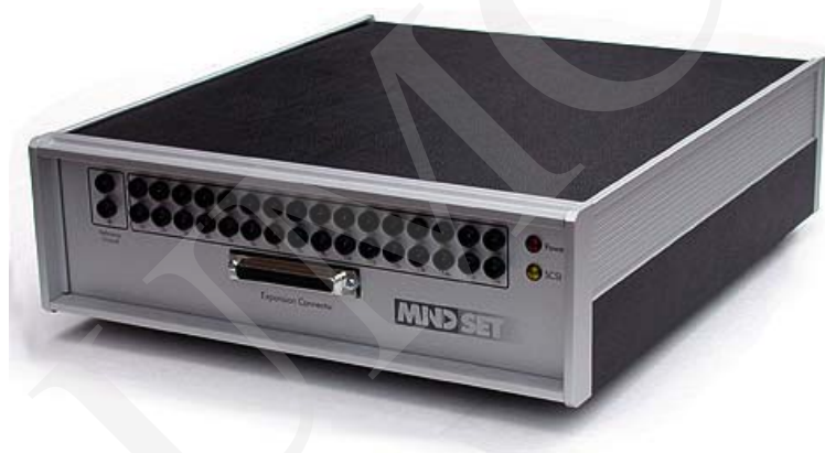
Fig. 1. Mindset MS-1000 EEG System.

MindSet MS 1000, manufactured by Nolan Computer Systems, is used as the hardware source of an EEG signal (Fig. 1). It is a real-time device containing a 16-channel analogue differential amplifier which receives signals from cap electrodes and amplifies them 32000 times. An amplified analogue signal is converted into a digital one as it goes through sample-and-hold circuits and an analogue-to-digital converter. Inside the device, there is a 32kB RAM buffer enabling it to withstand arrhythmical cooperation with a PC [9].