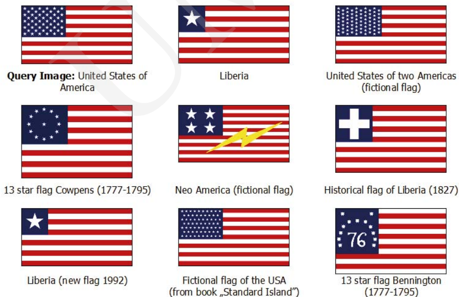
Fig. 3. Sample retrieval results. The most up-right image is a query object.