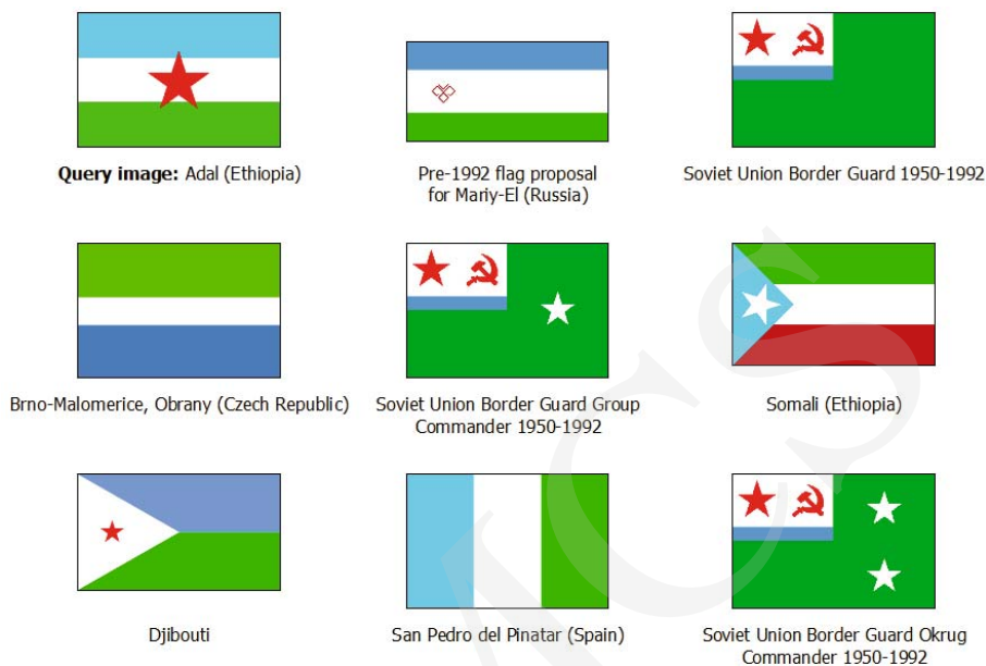
Fig. 2. Sample retrieval results. The most up-right image is a query object.