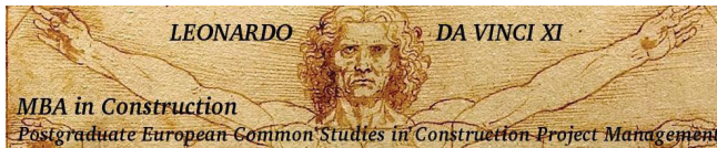
Fig.2. Logo of the MBAIC project.

Gedyminas Technical University (VGTU) – Lithuania; Poznan University of Technology (PUT) – Poland; Polish Association of Building Managers (PSMB) – Poland; University of Minho (UMinho) – Portugal; The Chartered Institute of Building (CIOB) - United Kingdom.