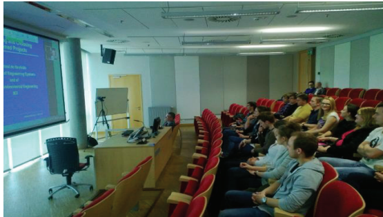
Fig. 4. Virtual meeting with prof. Richard de Neufville - MIT.