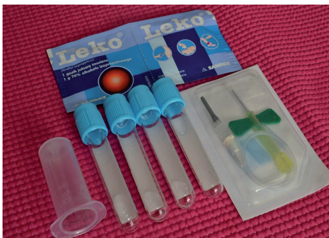
Fig. 2. "Closed" set for the patient's blood collection.