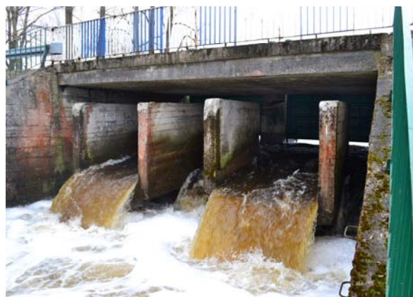
Photo 1. View of the multi-chamber weir in Glinny Stok village