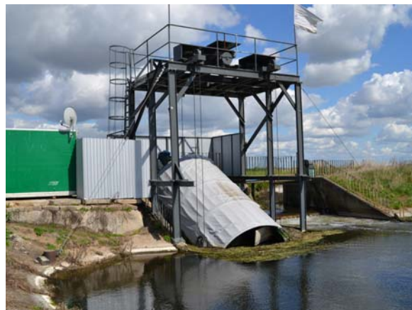
Photo 2. View of a hydroelectric plant built in 2016 in Tchórzew on Bystrzyca Północna River

Even in the absence of a significant impact of small hydropower plants on the environment, it is rational to use technologies that are less environmentally-damaging. A modern, inexpensive solution in the form of an Archimedes turbine – a water turbine, deserves special mention. This installation was implemented on the tributary of Tyśmienica – Bystrzyca Północna River (Photo 2) [MAZUR et al. 2016; WHEATON-GREEN 2016].